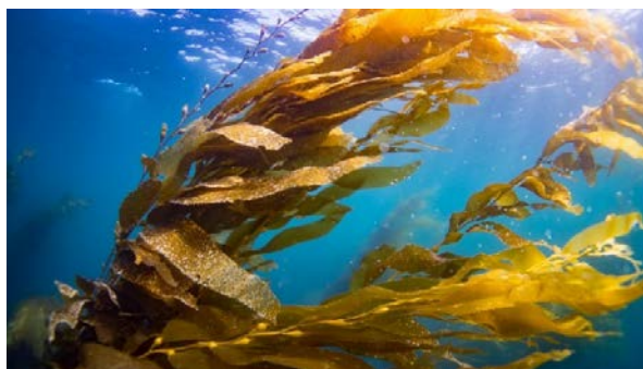
Kelp forests are an iconic and vital California marine ecosystem.

In addition, OPC has funded two smaller kelp-related projects through the Executive Director's delegated authority, both of which are now underway. These projects will directly inform the statewide kelp restoration toolkit. First – The Nature Conservancy is currently facilitating aerial surveys of kelp canopy cover (both surface and submerged) from Monterey to the California/Oregon border, and will also provide a comparative analysis of 2019 North Coast aerial and satellite imagery to inform long-term kelp canopy monitoring. Second – beginning this winter, scientists with Reef Check California will conduct urchin removals at two sites on California's North Coast to determine threshold urchin densities at which urchin barrens may be converted back to kelp forests.