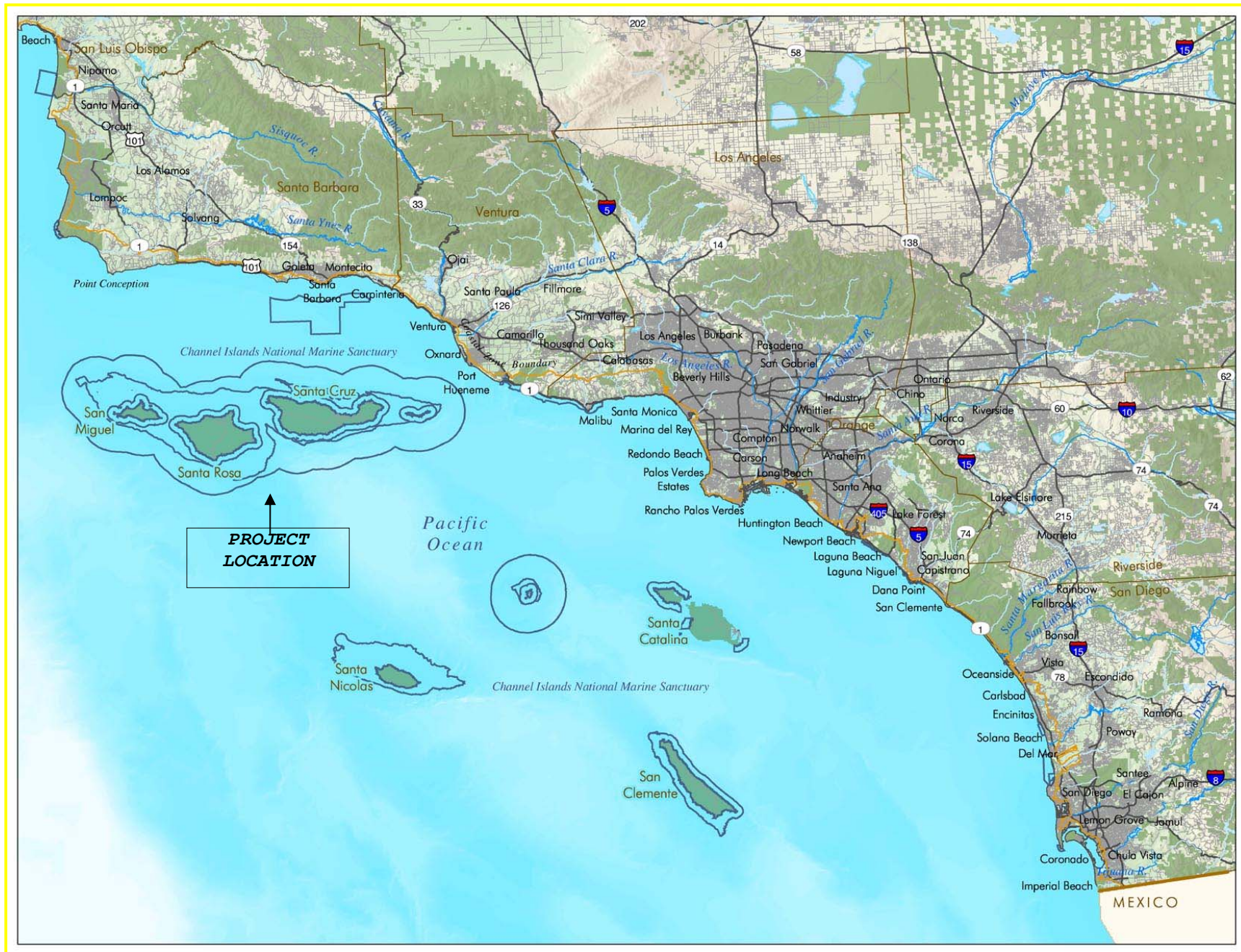
Exhibit 1: Project location map and site map