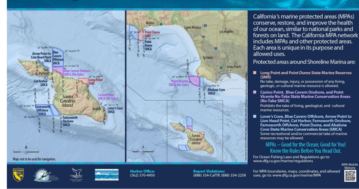
Exhibit 1 d. No Take/Collecting Sign