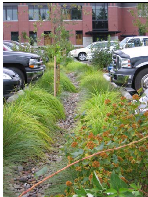
Parking lot runoff is allowed to infiltrate through a vegetated bioretention area

Low Impact Development (LID) is a stormwater management strategy that seeks to mitigate the impacts of increased runoff and stormwater pollution. LID comprises a set of site design approaches and small-scale stormwater management practices that promote the use of natural systems for infiltration, evapotranspiration, and reuse of rainwater. These practices can effectively remove nutrients, pathogens, and metals from stormwater, and they reduce the volume and intensity of stormwater flows.