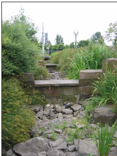
A rain garden manages runoff from impervious surfaces such as roofs and paved areas.

a Some of the case study results do not lend themselves to display in the format of this table (Central Park Commercial Redesigns, Crown Street, Poplar Street Apartments, Prairie Crossing, Portland Downspout Disconnection, and Toronto Green Roofs). b Negative values denote increased cost for the LID design over conventional development costs. c Mill Creek costs are reported on a per-lot basis.