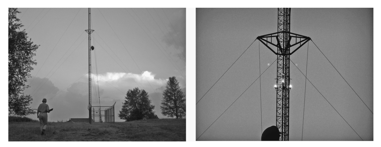
PLATE 1. In May and September 2003–2005, technicians seached under Michigan, USA, communcation towers for avian carcasses. Migratory birds collide with these structures and their supporting guy wires during periods of attraction to the nighttime lighting systems. Numbers of avian carcasses were compared among towers with different Federal Aviation Administration lighting systems.

Manville, unpublished manuscript ). Therefore, changing FAA obstruction lighting provides virtually the only means of reducing fatalities at existing towers.